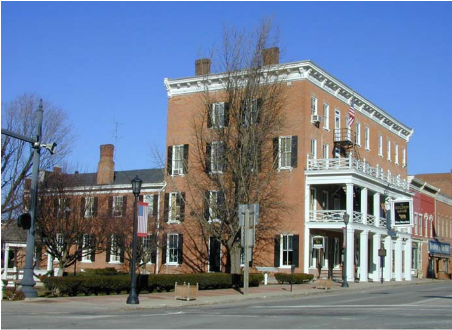
Landmark – The Golden Lamb Inn - Lebanon Town Center